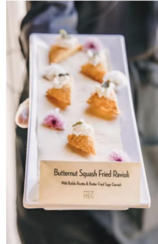
Above, below: Great food and wine brought people out to enjoy Left: Delicious bites served by Made by Meg